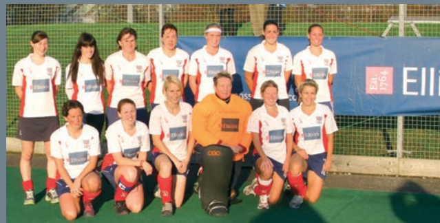
Ladies First Team

Tim and Kevin can actually claim a little more than a community attachment to the club. Both have played hockey for Colchester but and are very happy to provide a little more support than just cheering from the side-lines.