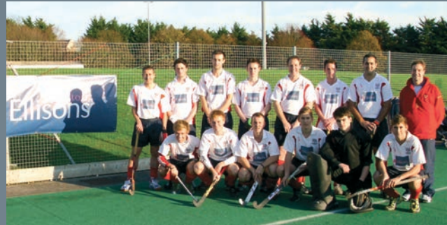
Mens First team